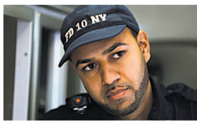
NEW YORK A24-29

Iraq's new prime minister faces feuding within his own party that threatens to undermine the government. PAGE A13